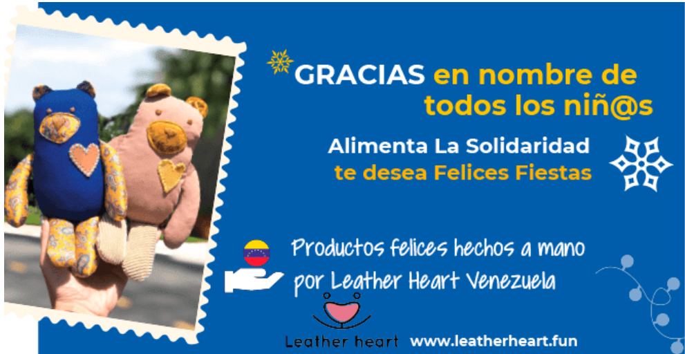
Figure 2. Alimenta la Solidaridad's 2021 Christmas communication.

digital communications guidelines for the co-branding of Coromoto 2020, in order to present communications with a uniform and coherent strategy.