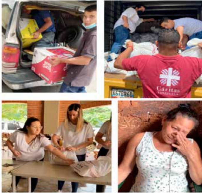
Figure 13. Example of the visual content for the attribute “Humanitarian”.