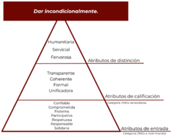
Figure 9. Pyramid of attributes for the Coromoto 2020 brand.

Figure 9 presents the pyramid of attributes of Coromoto 2020, which is a way of ordering the attributes of the Coromoto 2020 brand to serve as a basis for developing its positioning, as indicated by Damian (2021).