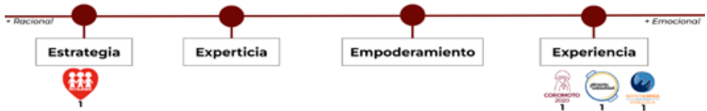
Figure 5. Communication channels for the NGO sector in Venezuela.