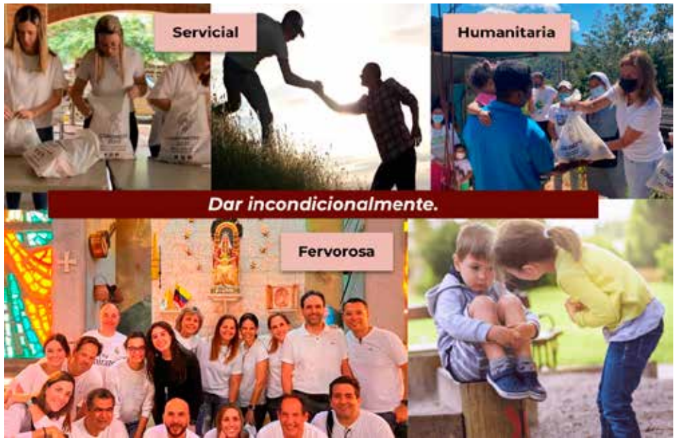
Figure 11. Emotion sheet for the Coromoto 2020 brand idea.