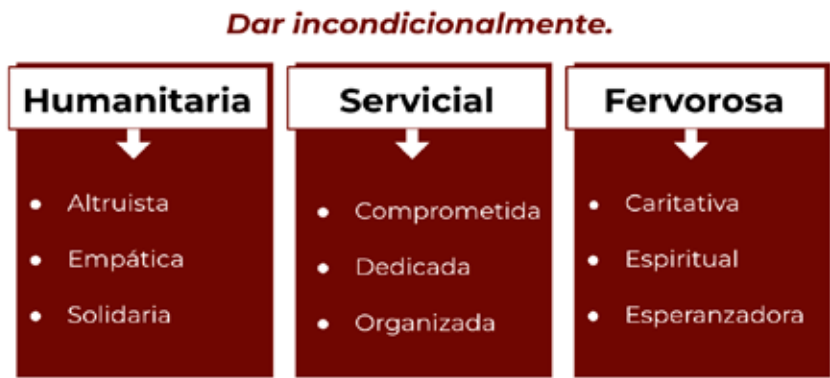
Figure 10. Sub-attributes of the Coromoto 2020 brand.