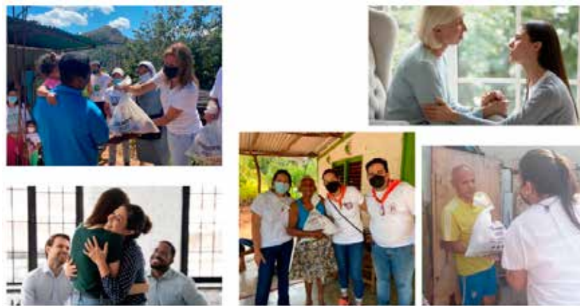
Figure 14. Example of the visual content for the attribute “Helpful”.