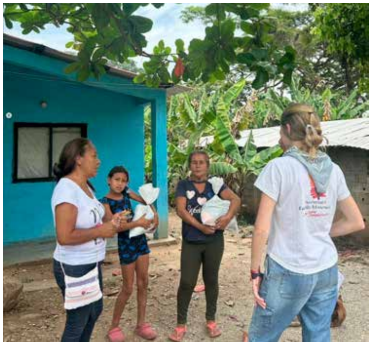
Figure 7. April 2023 publication.