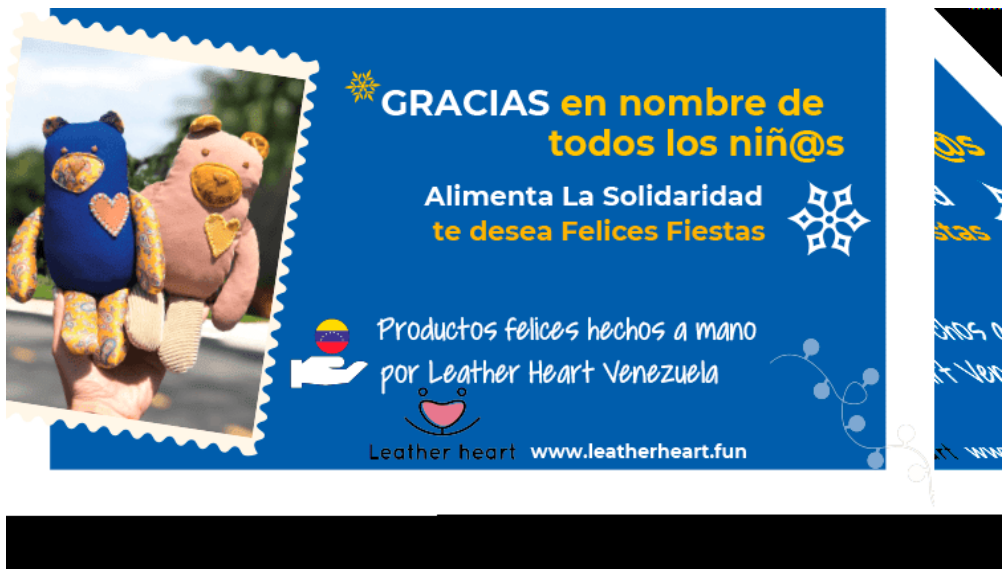
Figure 1. Example #1 of the LOUIS VUITTON X UNICEF campaign.

The collaboration between Louis Vuitton and UNICEF combines the luxury brand's global influence with the NGO's authority on children's rights. This partnership exemplifies the power of brand-NGO partnerships to address global challenges and create meaningful change by engaging consumers in humanitarian causes through products with purpose. The trend reflects the evolution of the business role toward active corporate social responsibility.