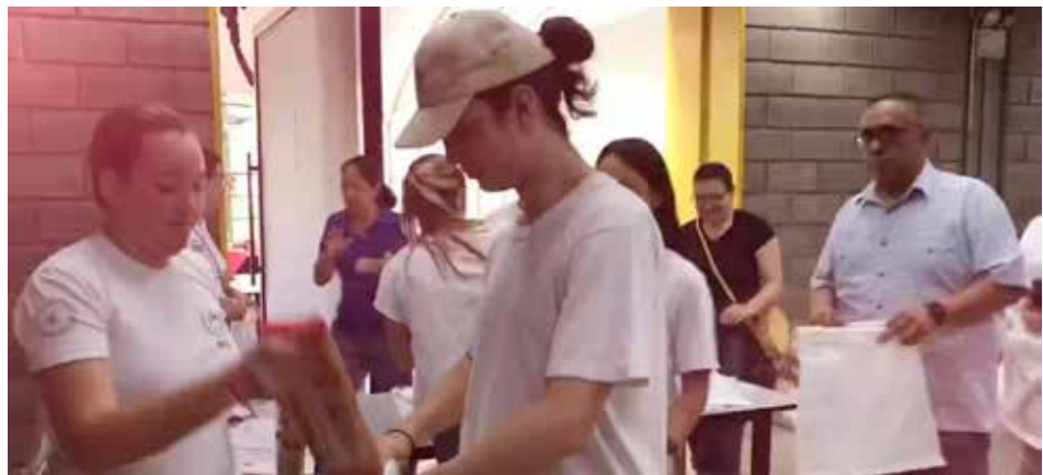
Figure 6. June 2023 publication.