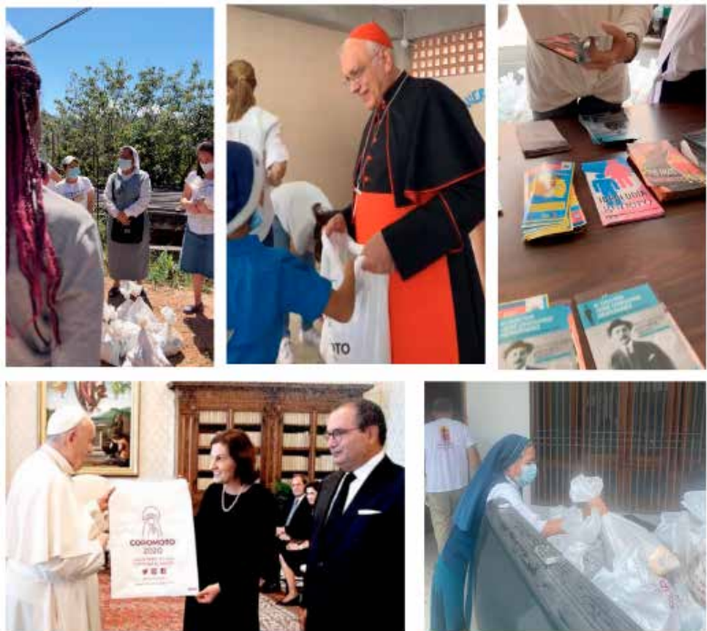
Figure 12. Example of the visual content for the attribute “Fervent”.