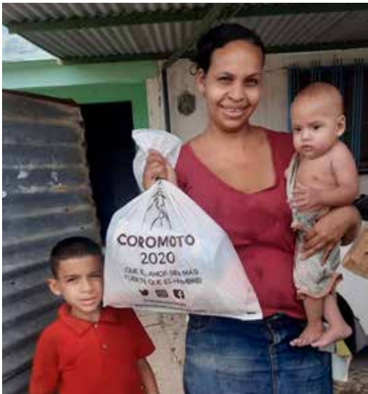
Figure 8. May 2023 publication.