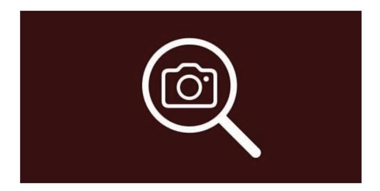
Figure 1. Figure title (upper part; Arial 9; no period; short)

Images should be inserted between the text and should not occupy more than one page. Texts in Tables and Figures should always be as brief as possible and formatted in Arial type. The image should be applied in PNG format in high resolution (300 ppi), in color.